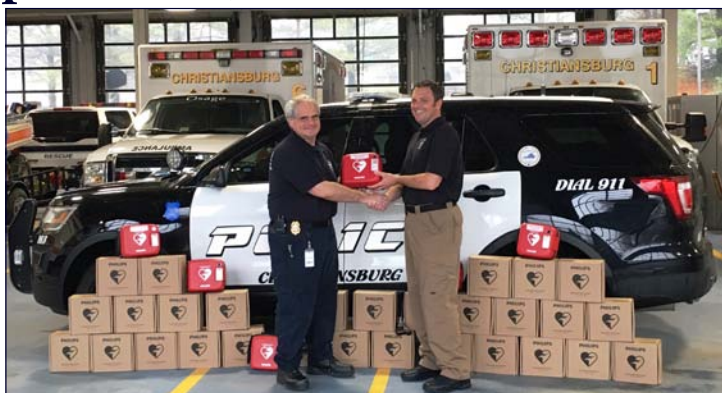
Christiansburg Rescue presented 35 Automated External Defibrillators (AEDs) to the Christiansburg Police Department in February. These AEDs are now deployed in patrol cars to assist with emergency response throughout the community.

Have questions? Let us know! (540) 382-6128 ext. 1151 info@christiansburg.org www.christiansburg.org